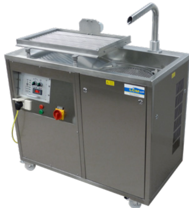
LCM 40 AT · LCM 60 AT