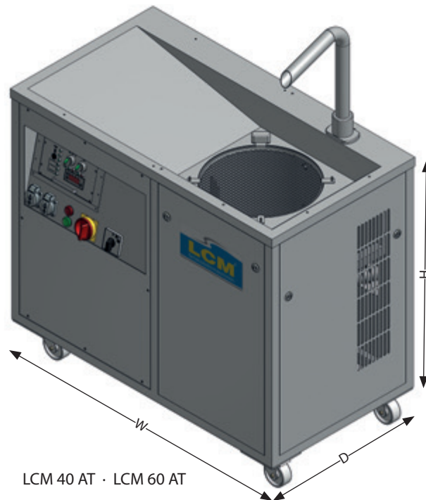
LCM 40 AT · LCM 60 AT