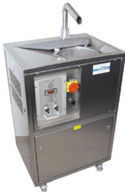
LCM 25 AT

Operation, change of chocolate and cleaning for these models is quite easy.